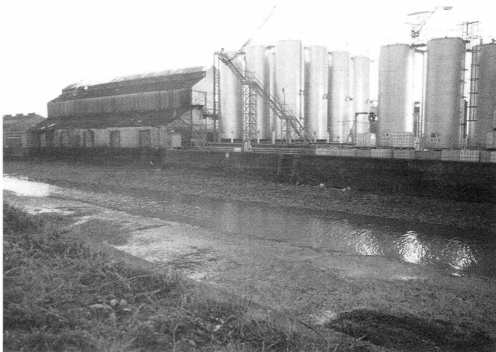
Siltation in the Bow Back Rivers. See editorial, page 3

Region web site : http://www.london.waterways.org.uk